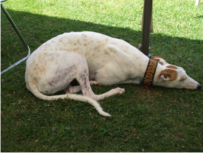
2007 Reunion Pictures!